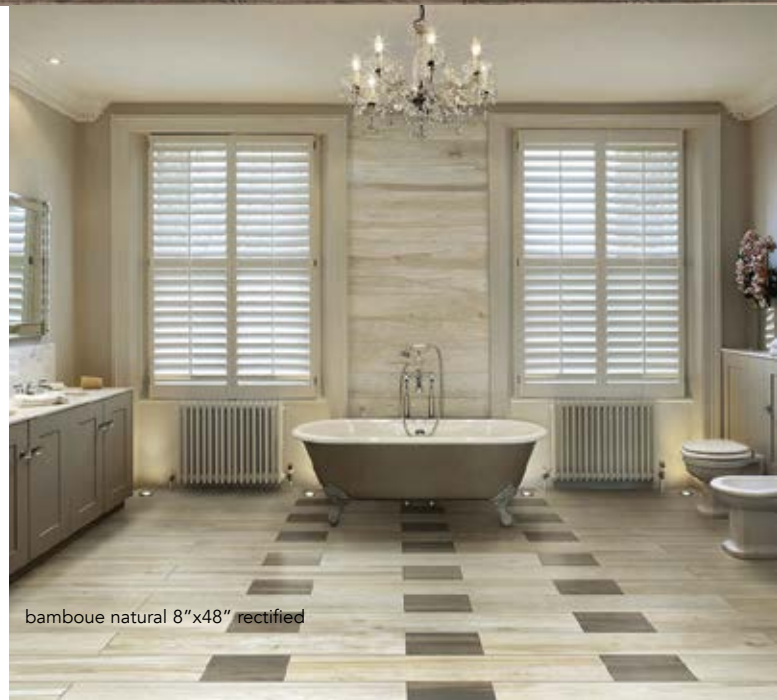
bamboue natural 8"x48" rectified