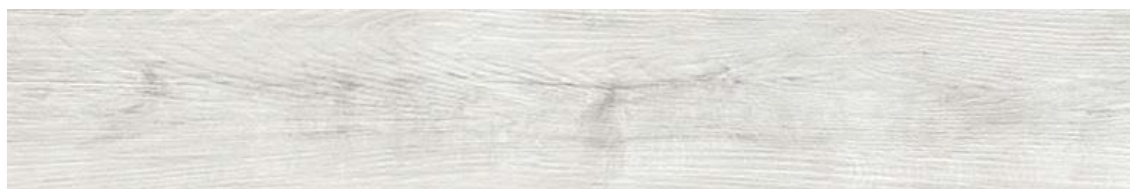
WNB00251 riz natural 8"x48" rectified in stock