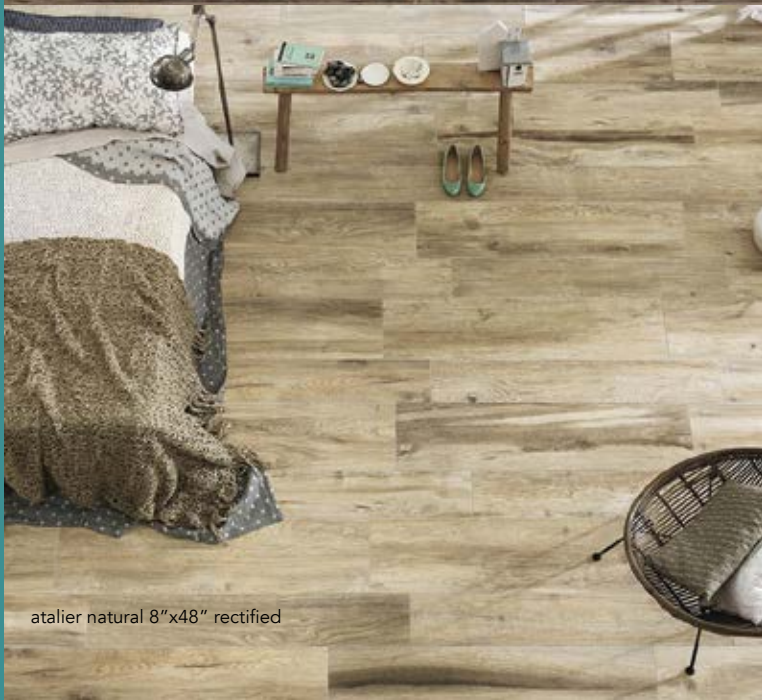
atalier natural 8"x48" rectified