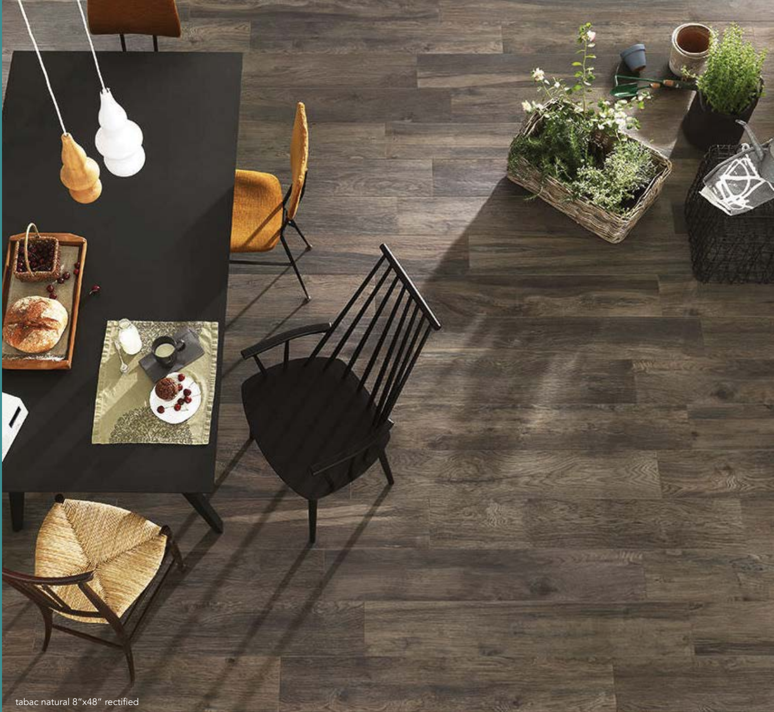
tabac natural 8"x48" rectified