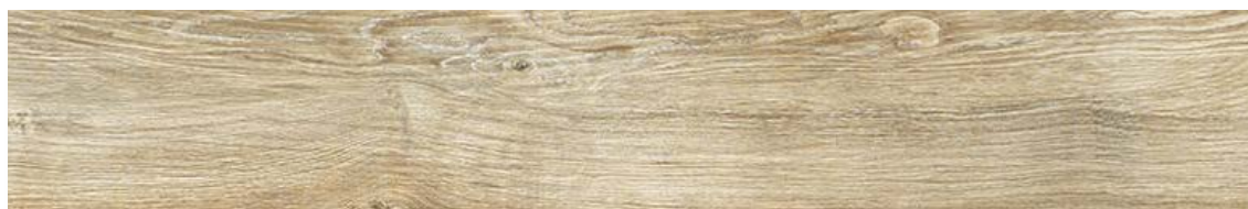
WNB00223 atelier natural 8"x48" rectified in stock