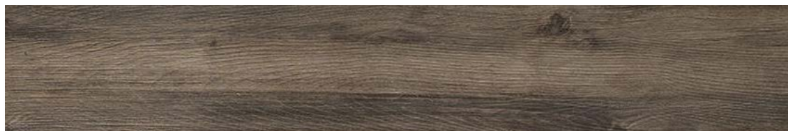
WNB00230 tabac natural 8"x48" rectified in stock

More sizes or finishes may be available through special order. Please contact your sales representative for more details.