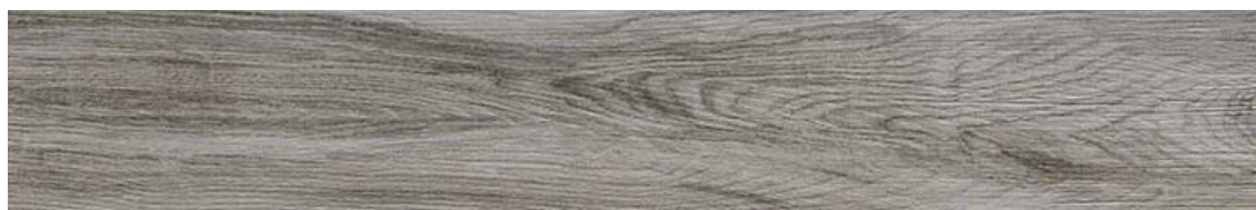
WNB00237 nuage natural 8"x48" rectified in stock