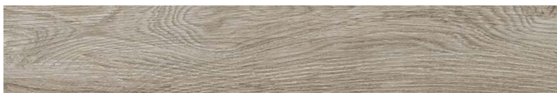
WNB00216 cannelle natural 8"x48" rectified in stock