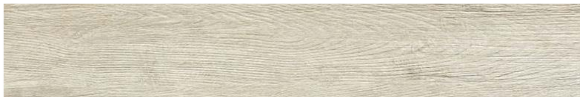
WNB00244 bamboue natural 8"x48" rectified in stock