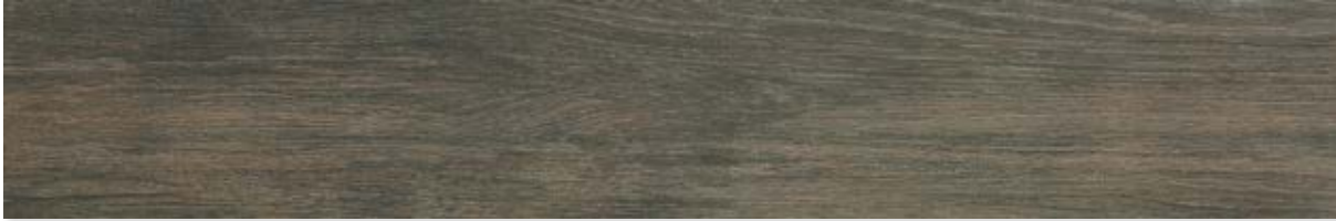
WIS11827 beech us matte 8"x48" in stock