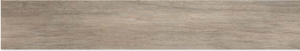
WIS11829 larch us matte 8"x48" in stock