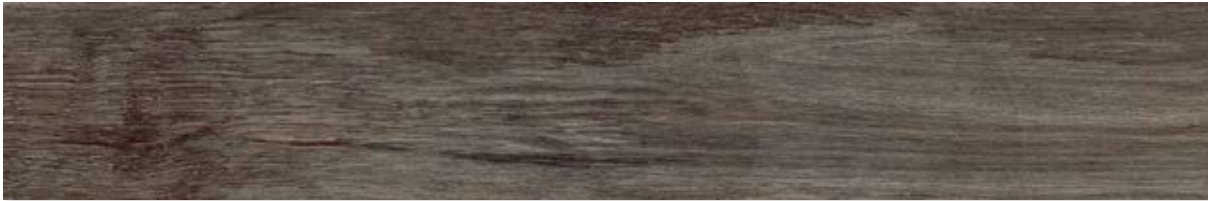
WIS11828 elm us matte 8"x48" in stock